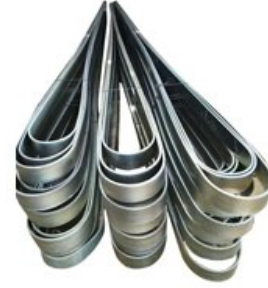
GI Earthing - 3 mtr GI strips