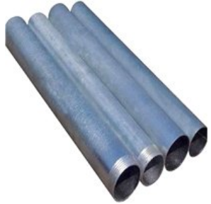
Riser Pipe- GI Pipe