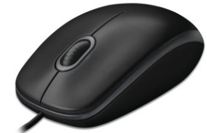
Mouse- Computer Item