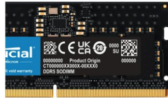
RAM- Computer Item