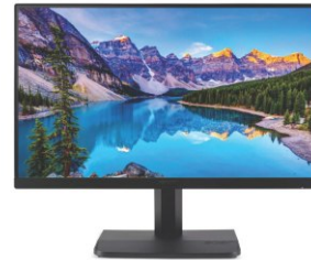
Monitor - Computer Item